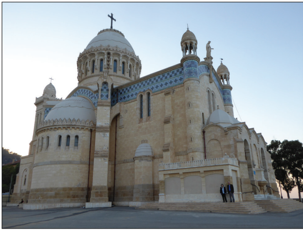
Figure 4: Notre-Dame d'Afrique Basilica, Algiers, Algeria